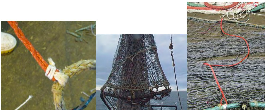
Figure 2. Photographs of the net restrictor, showing “clove-hitch”.