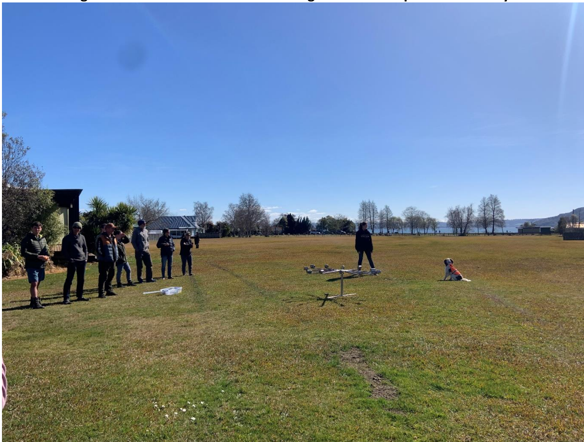
Figure 2. A demonstration at the NZCDP Detection Dog Annual Conference