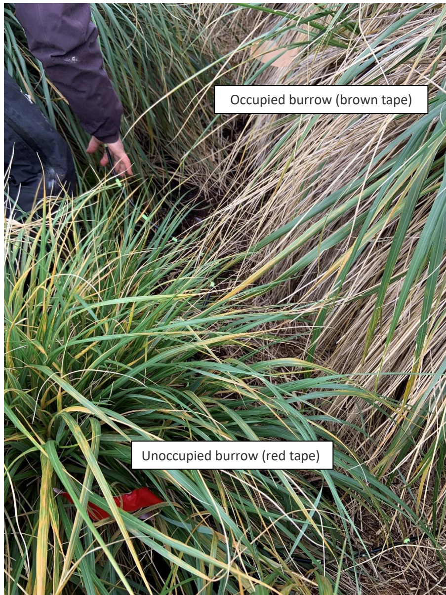
Figure 4. Sooty shearwater burrows in tussac were marked up to enable the handler to see immediately whether the dog was indicating on an occupied burrow

To aid in training and to combat K9 Missy's frustration, and to test her accuracy, a discrete area (roughly 5m x 20m of tussac on a slope) was marked out and every single burrow was checked with a burrowscope to confirm occupancy. Occupied and unoccupied burrows were marked with different coloured tape (see Figure 3) so it was immediately obvious to the handler when they were searching with the dog, which burrows had birds present or not.