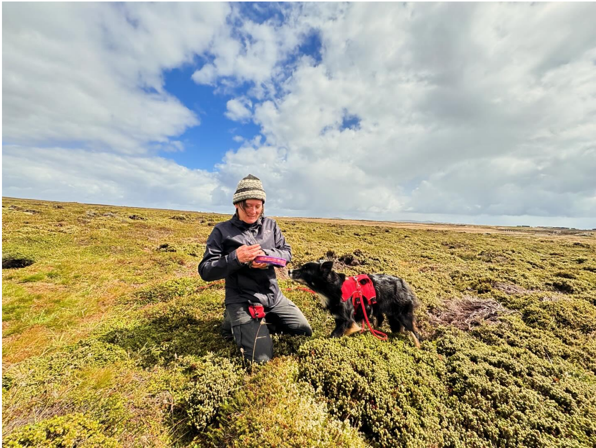
Figure 3. K9 Missy is rewarded for a good search around Magellanic penguin burrows with a 'goody ball' toy